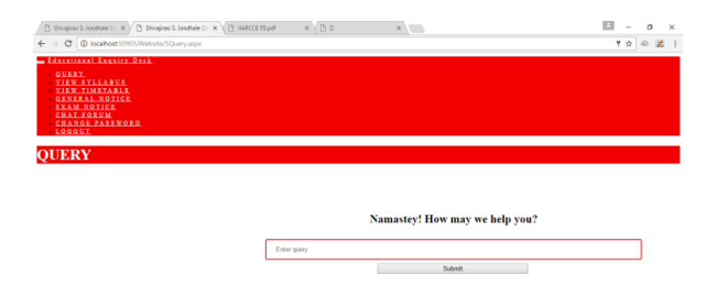
Figure 7 Student Module

Figure 7 shows the Student Module. In this module Chat Bot is provided for student, student can view time table, view syllabus, view general notice, view exam time table.