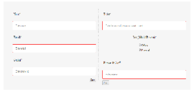
Figure 4. Visitors Page

Figure 4 shows visitors login page. Here visitor can login to the system, Information related to the visitor is stored here. Purpose of visit is also need to be mentioned. Figure 3 also provides the two options for visitors personal and official.