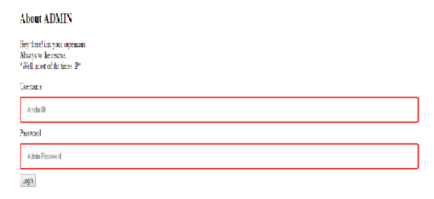
Figure 5. Admin Login

Figure 4 shows visitors login page. Here visitor can login to the system, Information related to the visitor is stored here. Purpose of visit is also need to be mentioned. Figure 3 also provides the two options for visitors personal and official.