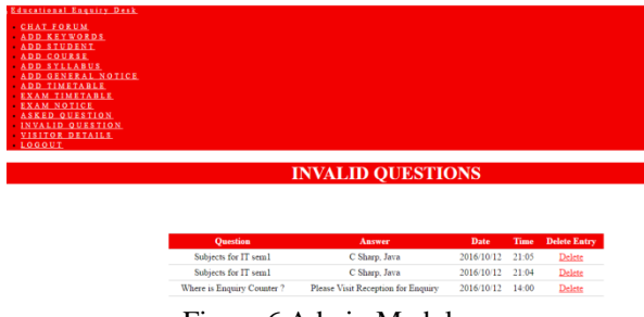
Figure 6 Admin Module

In the module shown in figure 5 Admin has to login to the system to access various pages.